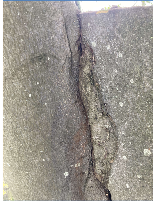
Figure 6 & 7 – Wounding from stem removal and reaction wood from crossing and rubbing stems