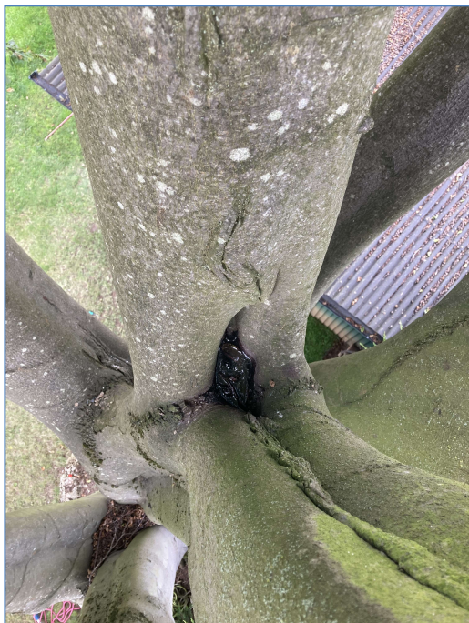
Figure 4 – Water pocket in union indentation