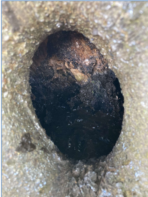
Figure 2 – Cavity on eastern stem at 3m