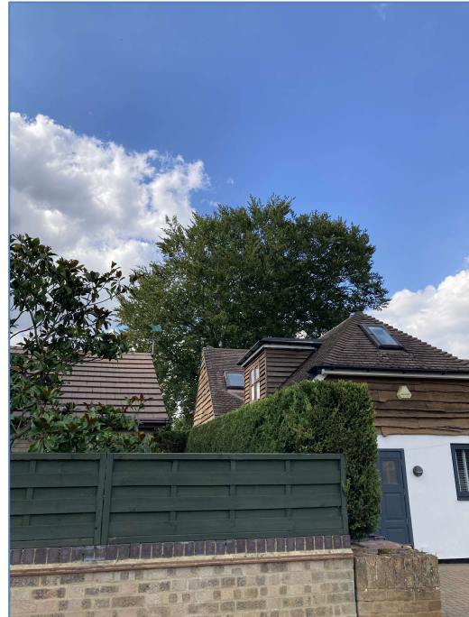
Figure 3 – View to T1 from outside 2 Coach Drive