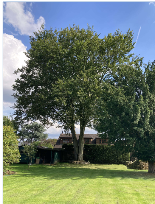
Figure 5 – View of beech from 4 Coach Drive